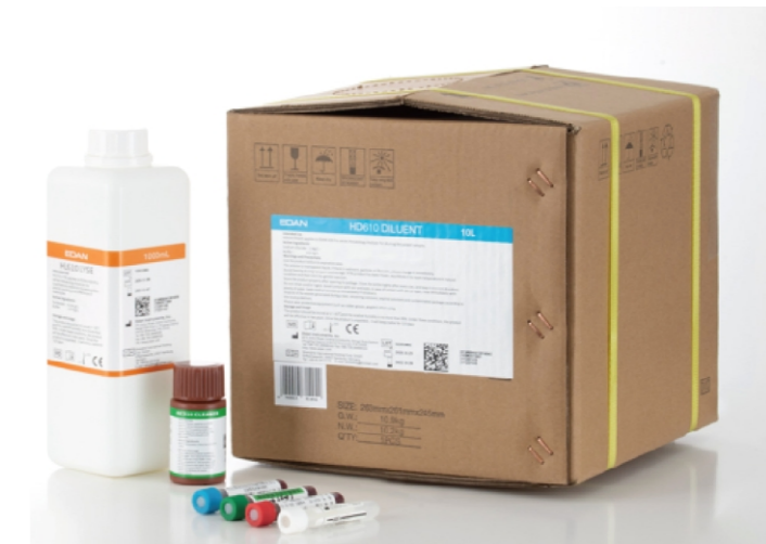
Two routine reagents to support test