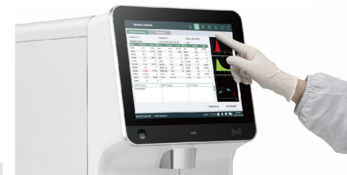
12"-inch Colorful touch screen

Reagent Management via RFID card secure your reagent business